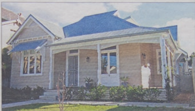
Creative thinking ... (from top) the dramatic extension is barely visible from the front of the cottage; the living room has a polished concrete floor and soaring ceiling.

Take the hassle out of home-hunting with Inspection Planner. Save the properties you want and print out your handy planner for open-homes. Go to Domain.com.au/planner